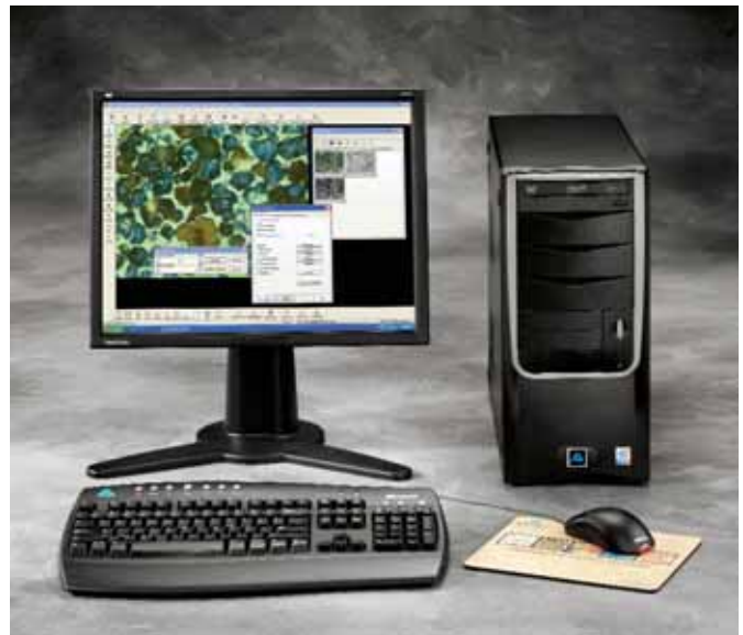
OmniMet® Modular Imaging Platform

Take your thin section analysis to the next level with a Buehler OmniMet® Image analysis system. Choose from a basic image capture system to a full blown image analysis