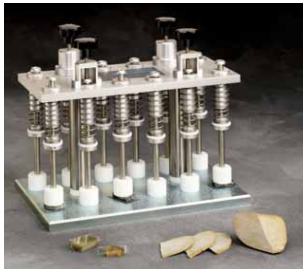
38-1490 PetroBond Thin-Sectioning Bonding Fixture assists in bonding 12 ground specimens to glass slides prior to re-sectioning.

glass slides. The spring activated loading fixture can accommodate up to 12 thin-section slides 2" x 3" (50 x 75mm). If the bonding agent requires heat, the entire fixture can be placed directly onto a hot plate.