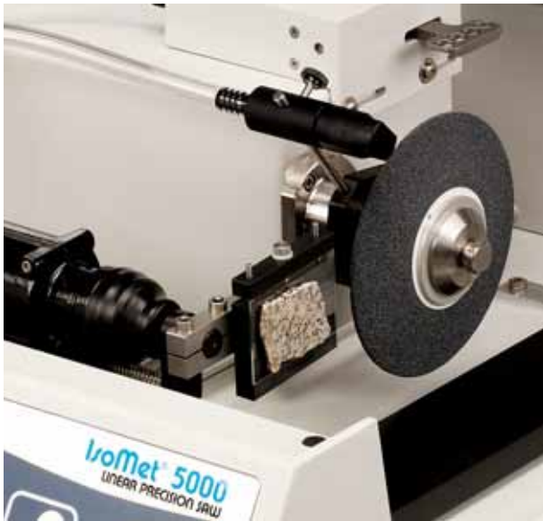
11-2780 IsoMet® 5000 with 11-2740 cup grinder shown. Cup grinding can be used for thin section preparation.

11-2780 IsoMet® 5000 Linear Precision Saw is a fully automatic linear feed precision saw. Similar to the IsoMet 4000, it is however, capable of automatic serial sectioning of a specimen to a precise thickness. This is achieved by using an automatic linear feed motor, which advances the specimen for repeated cuts of desired thickness. Thickness, speed, feed rate and other parameters are adjustable. The saw is ideal for serial sectioning bones or teeth where several thin sections can be used for mapping the specimen. In addition, a cup grinder attachment is available for grinding to a targeted depth which is useful for thin sections.