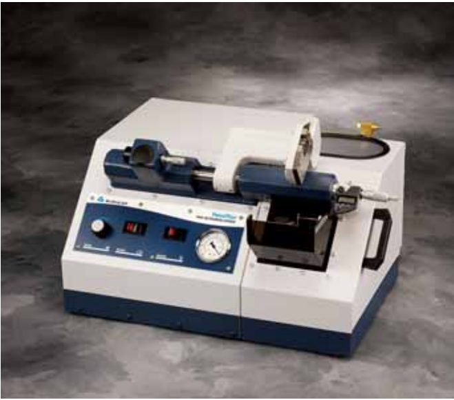
38-1450 PetroThin® Thin Sectioning System allows for the re-sectioning and grinding of rocks or minerals, ceramics and geological specimens in one machine. Grind to a thickness of ~100µm.