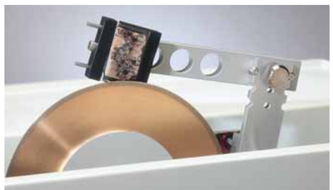
Top) A cement sample is precisely sectioned with the 11-1280 IsoMet® Low Speed Saw. Bottom) The 11-2488 Glass Slide Chuck for cutting glass slide mounted samples is shown.

11-2180 IsoMet® 1000 Precision Saw has a large cutting capacity with built-in inch or metric digital micrometer cross-feed for sample positioning. Its greatest speed is 975rpm with a maximum blade size of 7" (178mm). When sample size prohibits the use of standard chucks, an optional 11-2182 cutting table can be installed for manually sectioning or trimming. Accessory chucks are similar to the IsoMet Low Speed saw but have the capability of handling larger specimens.