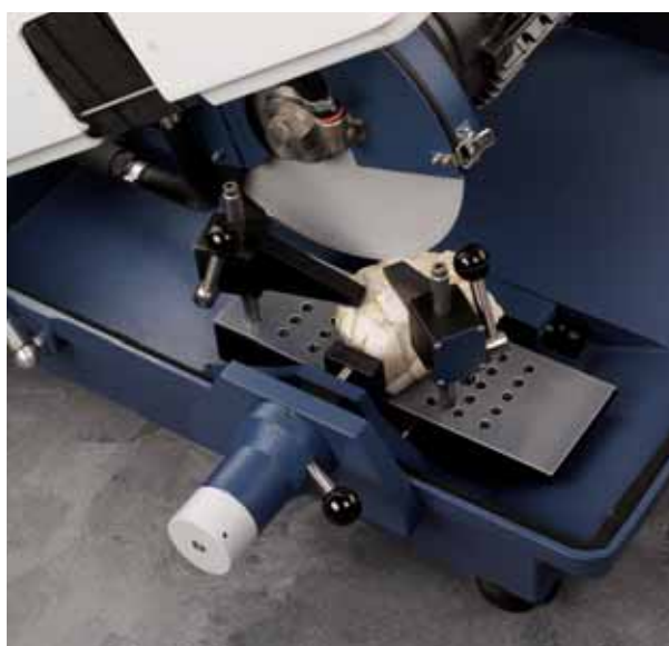
Top) The 11-1360 Lapro® 24" (610mm) Diamond Slab Saw is designed to section larger samples with a 9.5" (241mm) cutting depth. Bottom) The 10-2156 Delta® PetroCut® Geological Cutter features a Rock Clamp Assembly for holding most odd shaped rocks or minerals up to 3.75" (95mm) in diameter.