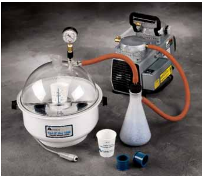
The 20-1382 Cast N' Vac 1000 is ideal for impregnating geological samples with a suitable bonding material that fills pores, cracks, and retards sample fracturing or plucking.

To impregnate or mount the specimen using a 20-1382 Cast N' Vac 1000, place it in a mold, such as SamplKups®. Place the SamplKup mold and the paper cup containing epoxy in the vacuum chamber. Turn the vacuum pump on to evacuate its chamber. This draws air from pores of the specimen and facilitates filling the pores with epoxy. When a proper vacuum has been attained, tilt the epoxy cup and pour the epoxy into the mold. Keep the mold under vacuum for 3-30 second intervals slowly releasing the vacuum between them allowing air to enter the chamber forcing embedding medium into the pores.